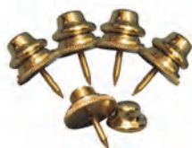
Nails embedded with incense

From around the 12th century the custom began of inscribing the current year on the candle as well as the dates of the principal movable feasts. Hence the candle grew in size.