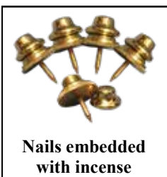
Nails embedded with incense

From around the 12th century the custom began of inscribing the current year on the candle as well as the dates of the principal movable feasts. Hence the candle grew in size.