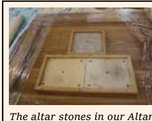
The altar stones in our Altar

The earliest Christian altars were of wood and shaped like ordinary house tables, a practice that continued until the Middle Ages. However, a preference for more durable materials led to church enactments against wooden altars. The earliest stone altars were the tombs of martyrs, over which Mass was sometimes offered, either on a stone slab enclosing the tomb or on a structure placed above it. When the first custom-built Christian basilicas were built, the altar of the church was placed directly above the tomb of a martyr, as in the case of St. Peter's Basilica and the Basilica of Saint Paul Outside the Walls.