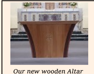
Our new wooden Altar