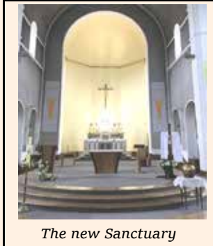
The new Sanctuary

Third Sunday of Easter, Year C, May 5th 2019. Bulletin No: 1266.