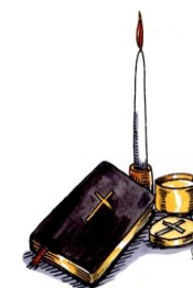
Anointing of the Sick