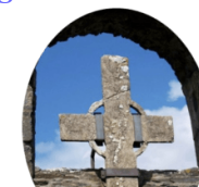
St. Colmcille's Partnership of Parishes

You can also click on the Partnership icon (shown on the right) this gives all the Mass times in the other churches of the partnership.